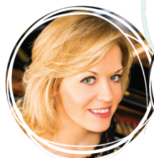
Olga Kern piano