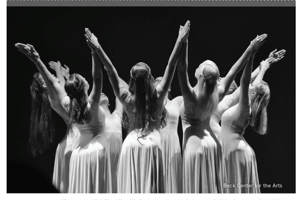
... WITH INVESTMENT BY CUYAHOGA ARTS & CULTURE

Cuyahoga Arts & Culture (CAC) uses public dollars approved by you to bring arts and culture to every corner of our County. From grade schools to senior centers to large public events and investments to small neighborhood art projects and educational outreach, we are leveraging your investment for everyone to experience.