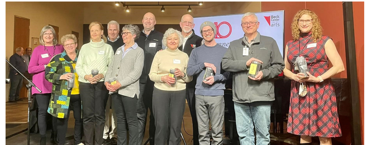
Beck Center's five-year milestone volunteers and employees

90th season announcement on Tuesday evening May 16 at Beck Center, free and open to the public. Information will be available soon on BeckCenter.org