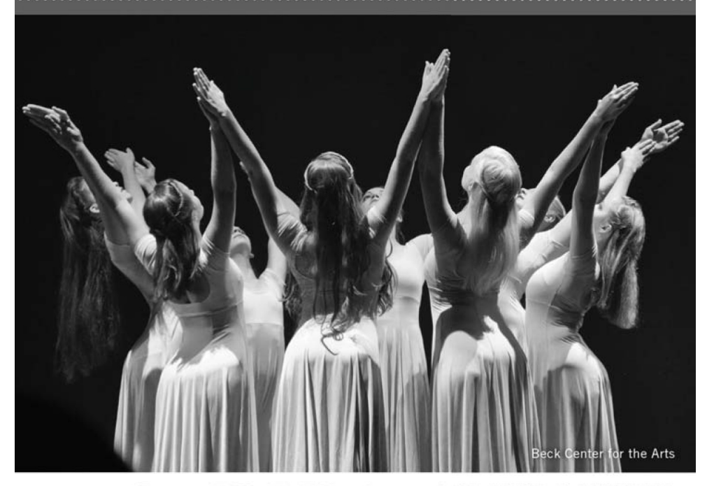
... WITH INVESTMENT BY CUYAHOGA ARTS & CULTURE

Cuyahoga Arts & Culture (CAC) uses public dollars approved by you to bring arts and culture to every corner of our County. From grade schools to senior centers to large public events and investments to small neighborhood art projects and educational outreach, we are leveraging your investment for everyone to experience.