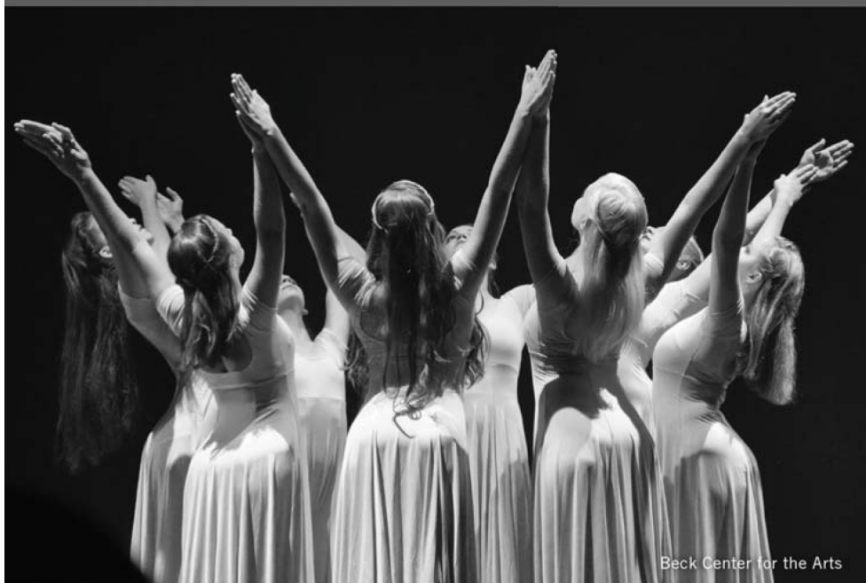
Beck Center for the Arts